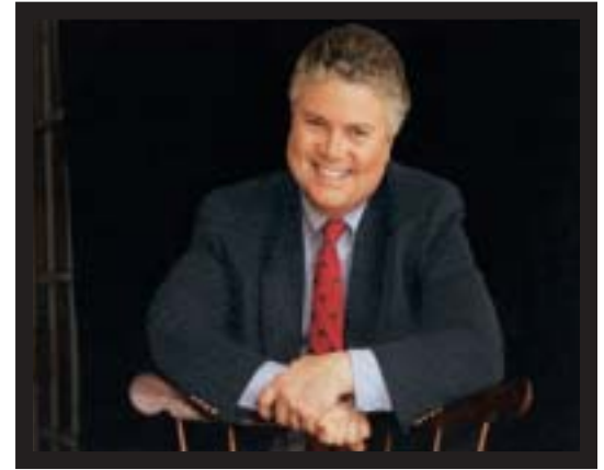
Dr. Edward M. Hallowell, M.D.

Privilege, wealth, and expensive “extras” are not necessary for happiness—there are many stories here of children who have overcome poverty, abandonment, and shocking deprivation to find true fulfillment. Dr. Hallowell encourages us as parents to reconnect with the moments in our own childhoods that made a difference; he explores the