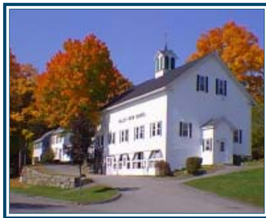
Valley View School

I had the chance to visit Elan School (Maine); Spring Lake Ranch (Vermont); Hunter School and Shortridge Academy in New Hampshire. Then on my drive back to Clearwater I was able to stop along the way and visit other NATSAP Members.